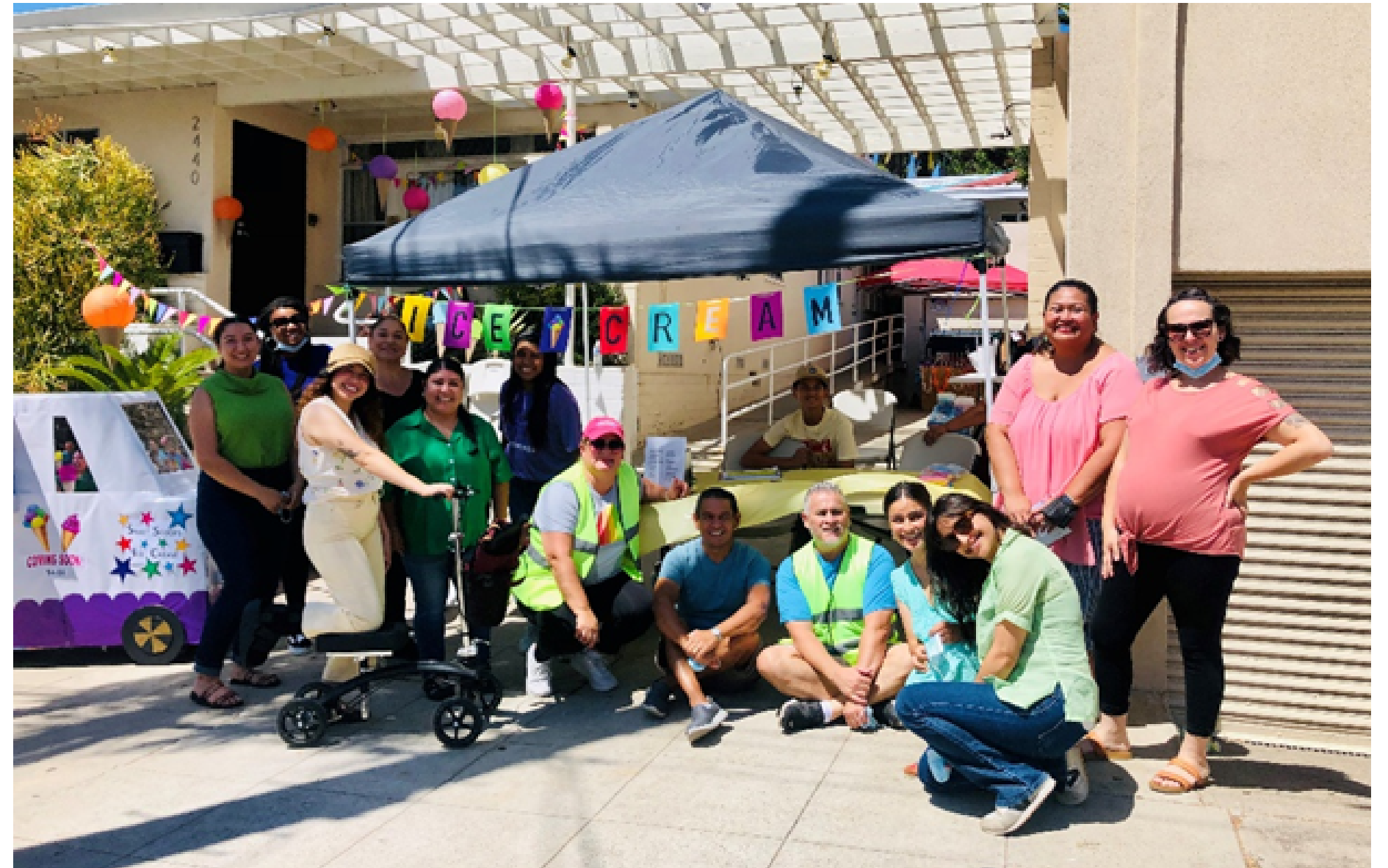
Family-centered events and programs