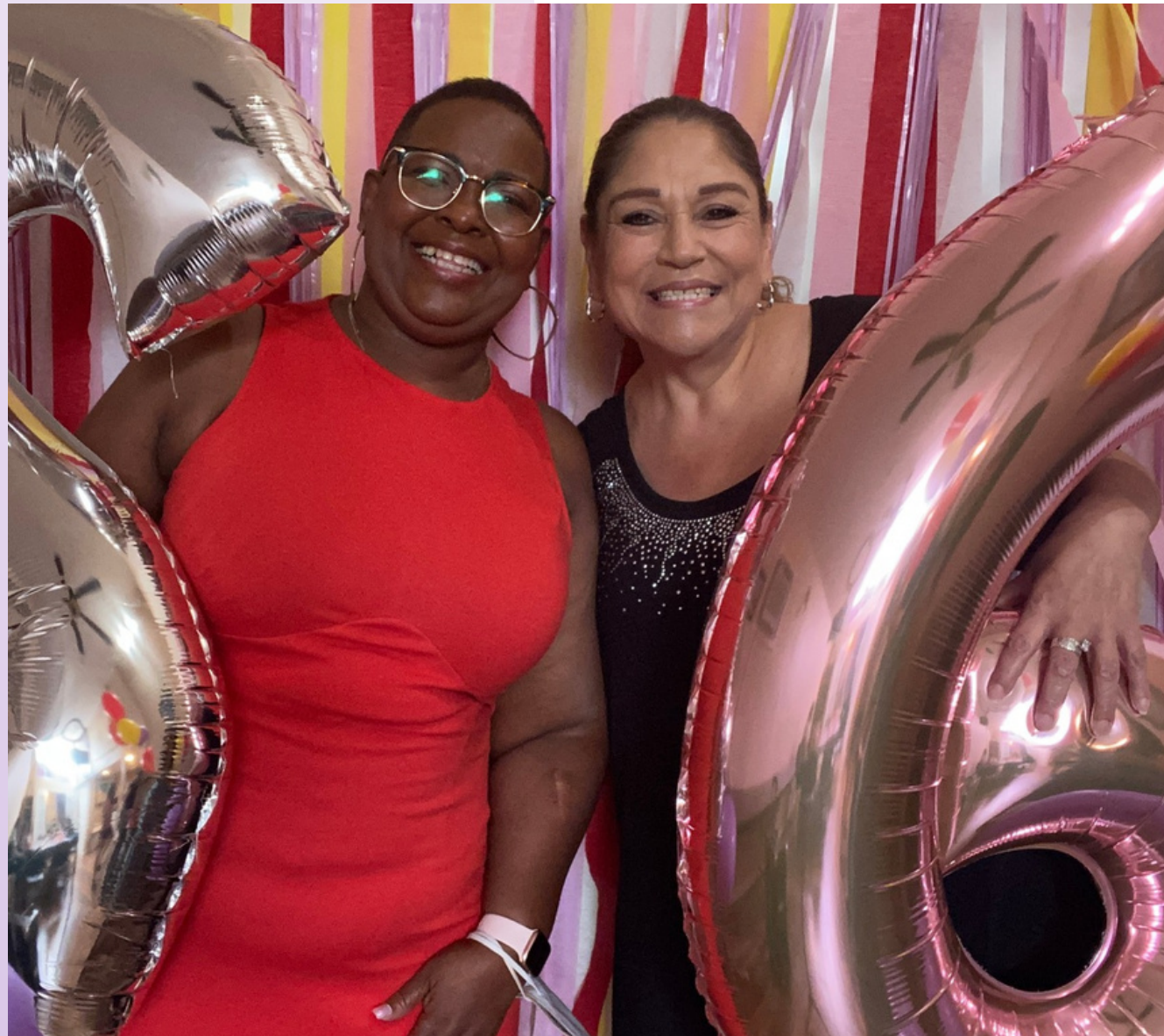
Peer Navigation by women living with HIV